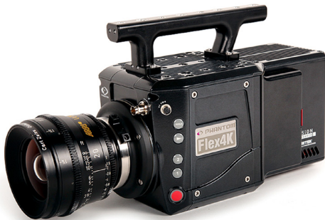
Vision Research Phantom Flex4K

The QRC-FLEX 4K Gold Mount® installs quickly on the Vision Research Phantom FLEX4k camera for use with Anton/Bauer DIGITAL and Logic Series® batteries. A single PowerTap® output is provided to power accessories.