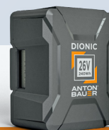
Dionic 26V 240Wh