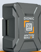
Dionic 26V 99Wh

26V power wherever you need it - DIONIC 26V 99Wh batteries are safety certified to comply with UN38.3 IATA lithium-ion battery regulations.